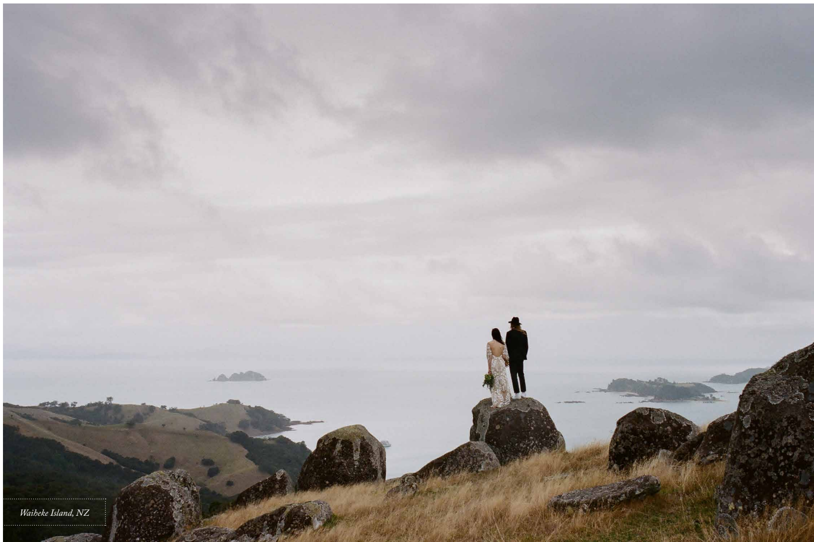
Waiheke Island, NZ